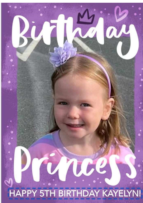
Lots of love from all the family xxoo

Those associated with the Cathedral were excellent ambassadors for the Cathedral and we are so proud of them.