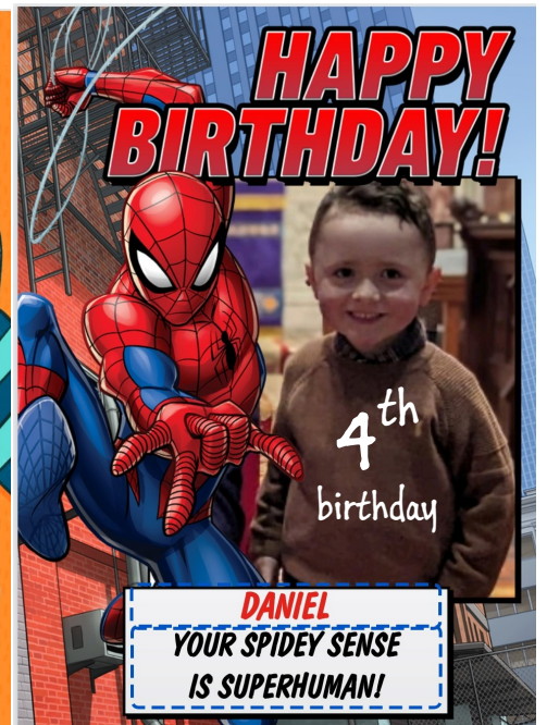
Lots of love from all the family xxoo